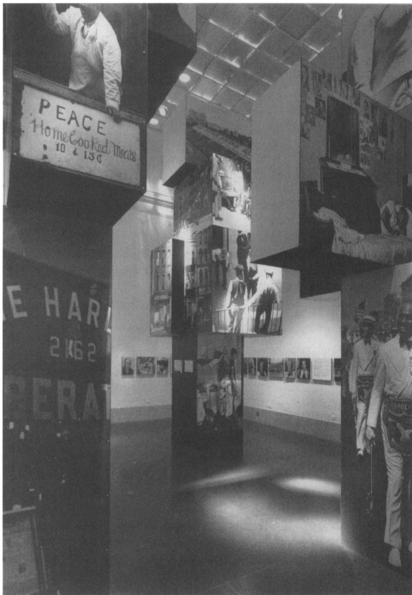
Figure 4: “1930–1939: Depression and Hard Times,” Exhibition Gallery Museum Views, Interior. Special Exhibitions: Harlem on My Mind: Cultural Capital of Black America, 1900–1968 . Gallery Installation: Photographed March 25, 1969; The Metropolitan Museum of Art.