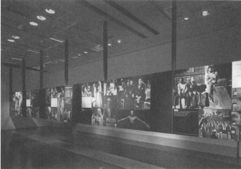
Figure 6: “1950–1959: Frustration and Ambivalence,” Exhibition Gallery Museum Views, Interior. Special Exhibitions: Harlem on My Mind: Cultural Capital of Black America, 1900–1968 . Gallery Installation: Photographed March 25, 1969; The Metropolitan Museum of Art.

At 1:00 p.m. we started our demonstration at the Metropolitan against the “Harlem on My Mind” show. The police were waiting for us with barricades and very stern looks. A line of the Museum’s staff were right inside the Museum with their noses pressed against the glass doors peering out at us. We formed a long oval line and started to walk slowly around and around the police barricades with our placards denouncing the exhibition. The passing pedestrians and street traffic practically came to a halt when they spotted this small slow line of Black people in front of this massive, angry, forbidding, endless façade of the Metropolitan Museum of Art. 63