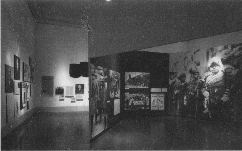
Figure 2: “1920–1929: An Urban Black Culture,” Exhibition Gallery Museum Views, Interior. Special Exhibitions: Harlem on My Mind: Cultural Capital of Black America, 1900–1968 . Gallery Installation: Photographed March 25, 1969; The Metropolitan Museum of Art.