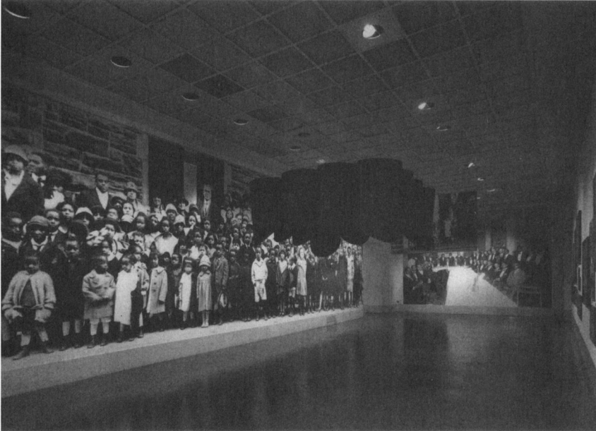
Figure 5: “1900–1919: From White to Black Harlem,” Exhibition Gallery Museum Views, Interior. Special Exhibitions: Harlem on My Mind: Cultural Capital of Black America, 1900–1968 . Gallery Installation: Photographed March 25, 1969; The Metropolitan Museum of Art.

ues, and politics was most important for the cross-cultural success of Harlem on My Mind . Schoener organized a popular humanistic project instead of engaging in a reflective examination and understanding of the diversity of the community that he chose to represent.