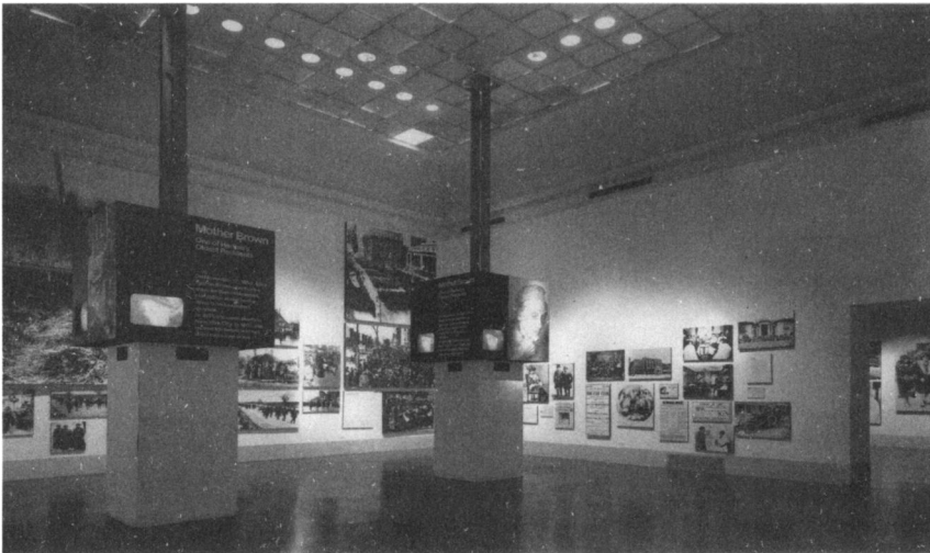
Figure 3: “1900–1919: From White to Black,” Exhibition Gallery Museum Views, Interior. Special Exhibitions: Harlem on My Mind: Cultural Capital of Black America, 1900–1968 . Gallery Installation: Photographed March 25, 1969; The Metropolitan Museum of Art.